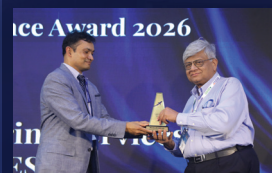
AI Engineering Services Limited (AIESL) MRO Excellence