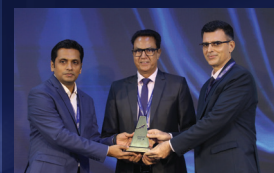
Amadeus & AECOM Partnership Excellence