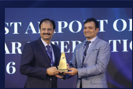
Indira Gandhi International Airport, Delhi Best Airport of the Year — International (North)