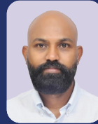
Joseph Gouda Joint Commissioner Indian Revenue Service (IRS)