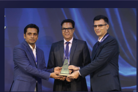
Excellence in Airport Facility Management Gold, OCS Group India Pvt Ltd