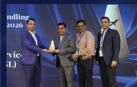
AI Airport Services Limited (AIASL) Best Ground Handling Services