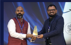
Sardar Vallabhbhai Patel International Airport, Ahmedabad Sustainability Excellence — Gold