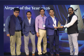
Navi Mumbai International Airport Emerging Airport of the Year Outstanding Terminal Technology Partnership Excellence