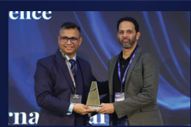
Bangalore International Airport Ltd Best Airport of the Year — International (South); Best Passenger Experience Design