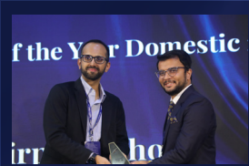
Raja Bhoj Airport, Bhopal Best Airport of the Year — Domestic