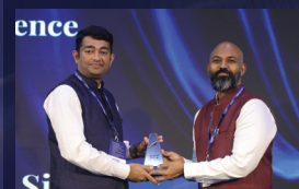
Chaudhary Charan Singh International Airport, Lucknow Sustainability Excellence — Silver