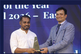
Lokpriya Gopinath Bordoloi International Airport, Guwahati Best Airport of the Year — International (East)