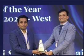
Mumbai International Airport Limited (CSMIA) Best Airport of the Year — International (West) Partnership Excellence